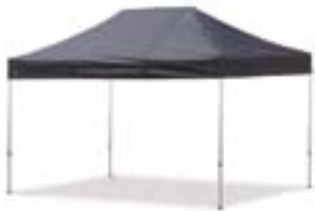
3m x 4.5m (Black)