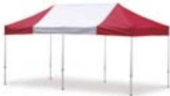
3m x 6m (Red & White)