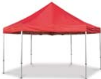
NEW! Hexagonal (Red)