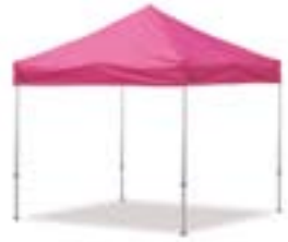
3m x 3m (Extreme Pink)

We also stock and supply everything you'll need from sand bags to hand trolleys. Call us for pricing or anything else you'd like to know.